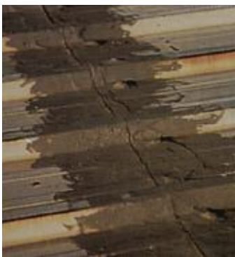
Seam and fastener problems.