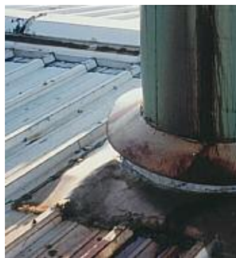
Cracks or leaks around penetrations.